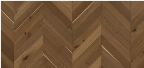
Brushed Oak Brera 32468