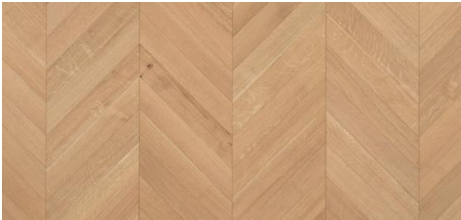
Brushed Oak Isola 32466