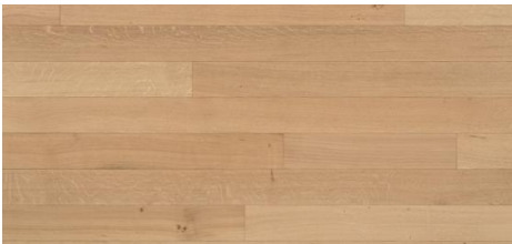
Brushed Oak Isola 32463