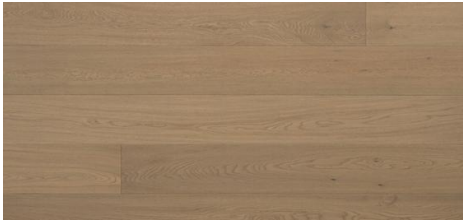
Sculpted Oak Steamship 32165