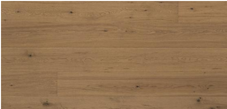
Sculpted Oak Harvest Table 32105