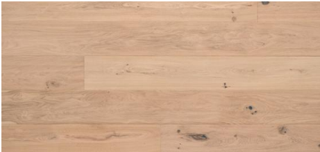
Sculpted Oak Lake Side 31872