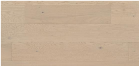
Brushed Oak Horizon 32399