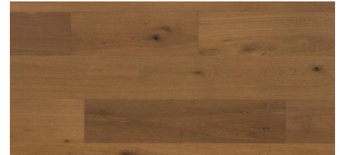
Brushed Oak Warm Ember 32398