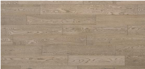
Brushed Oak Stonecrop 31789