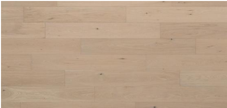
Brushed Oak Junco 32103