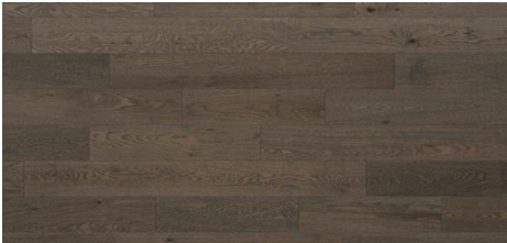
Brushed Oak Coho 31790