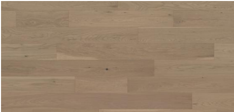
Brushed Oak Pintail 32164