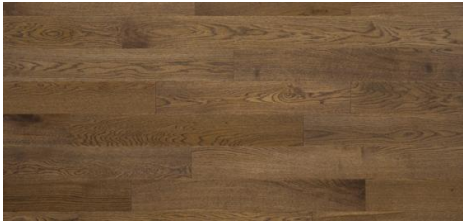
Brushed Oak Cardinal 31683