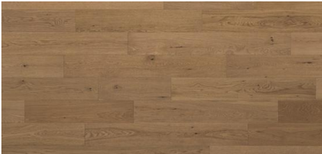
Brushed Oak King Shepherd 32102