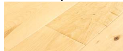
Birch 'Glacier Peak'