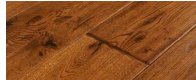
Oak 'American Prairie'