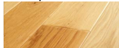
Hickory Pecan 'Natural'***