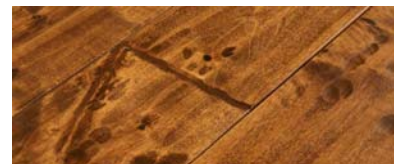
Birch 'Copper City'