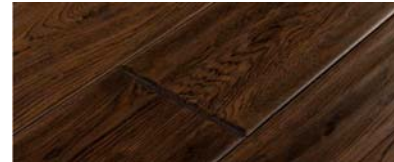
Oak 'Canyon Creek'